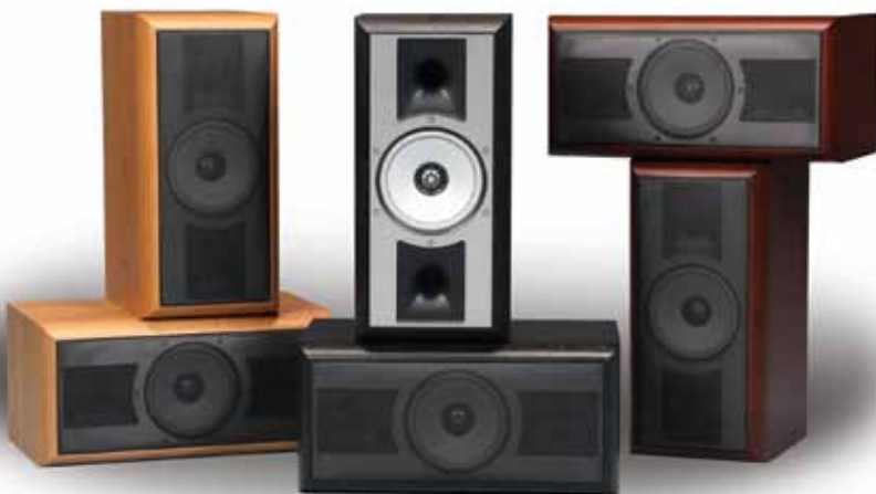
The award-winning SCS4 bookshelf loudspeaker may be positioned horizontally or vertically without compromising coherence. J.E.T. collection finishes shown here from left, Natural Cherry, Black Ash and Dark Cherry.