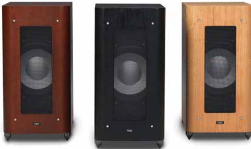
The USS SmartSub is available in Dark Cherry, Black Ash, and Natural Cherry and comes standard with attractive, gunmetal finish spikes.

At only 55 pounds, this compact sub is easy to move and place in real-world room placement situations and provides very high quality, low distortion output uniformly down to subsonic range. With the use of the THIEL PXO5 Passive Crossover, up to two USS subwoofers per channel can be perfectly blended without the inaccuracy of variable crossovers.