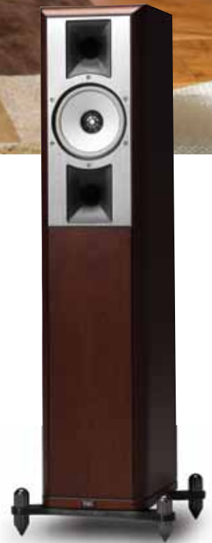
SCS4T Loudspeakers (shown here in Dark Cherry) include attractive and functional Outriggers and spikes for greater stability.

The SCS4T and SCS4 are two-way loudspeakers whose output capability satisfies the demanding requirements of today's home theater systems. Utilizing the award-winning coaxial driver design developed for THIEL's architectural collection and incorporating the same innovative THIEL technologies that are used in our much more expensive products, the SCS4T and SCS4 provide exceptionally realistic and dynamic sonic performance, regardless of listener or speaker position.